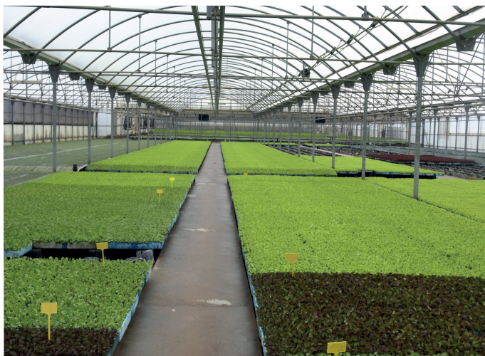
Bedding Plants in Nursery

In 2012 they ran their own trial using Grazers in an attempt to reduce the huge losses. After talking with us at Grazers we worked out a spray programme which was effective and practical on a large scale operation.