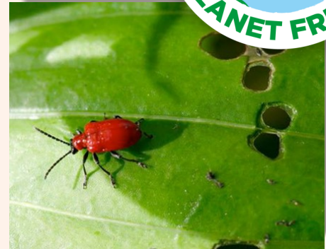
Red Lily beetle adults and larvae ( Lilioceris lili )